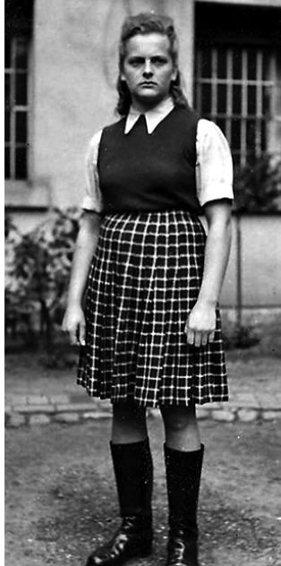
Figure 1 25

Womanhood," was employed as an SS-Aufseherin , supposedly to help the German cause, yet she secretly thwarted the Nazis through many of her actions, especially this one. For a pure, Aryan woman, even if the child she bore were illegitimate, that child was still considered by the Nazis to be a "valuable" member of German society. An Aryan abortion was explicitly prohibited within Nazi Germany.